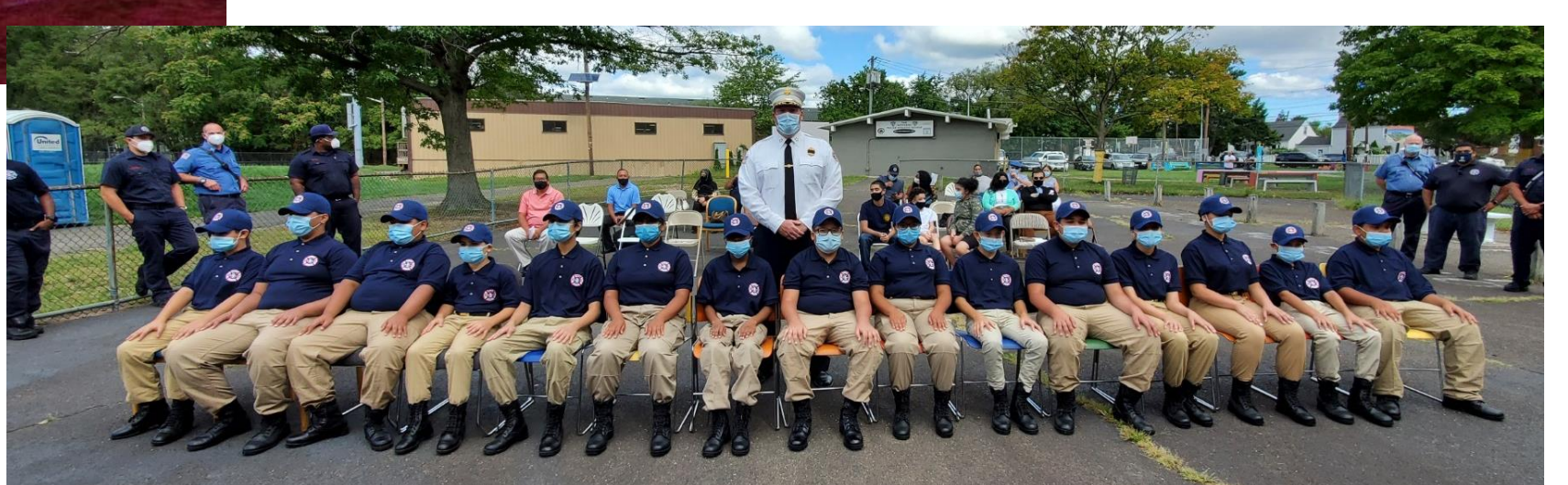
For Our Youth to Thrive