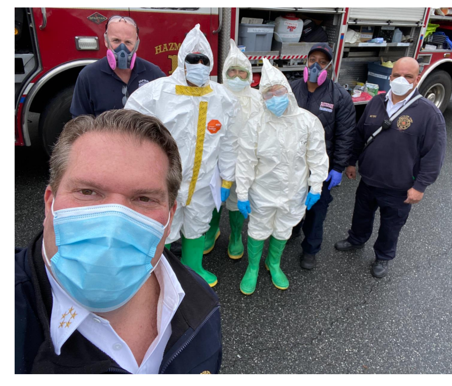
Perform for those that Protect